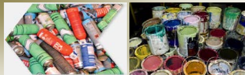
Picture from the following website: https://www.ecodeal.pt/en/services/integrated-management-of-hazardous-and-non-hazardous-waste and https://www.ecoflo.com/hazardous-waste-disposal-atlanta/

All records of offsite disposal need to be maintained for two years.